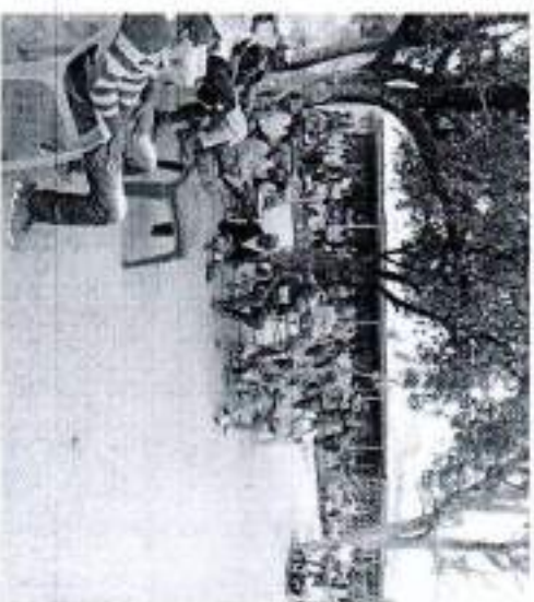
Muthu/Kaliku Ward public participation

Comments by Area Member of National Assembly and MCA