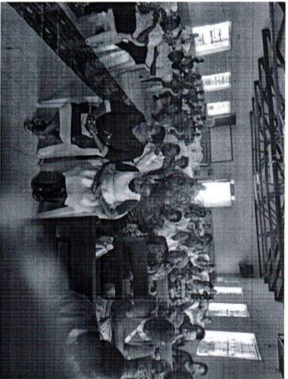
Nzambani ward public participation.