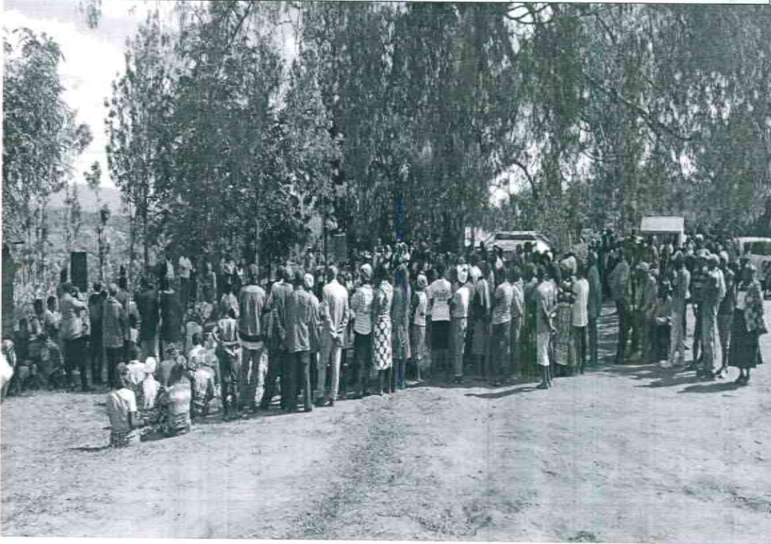
Members of the public listening as the HON. MP addresses them.