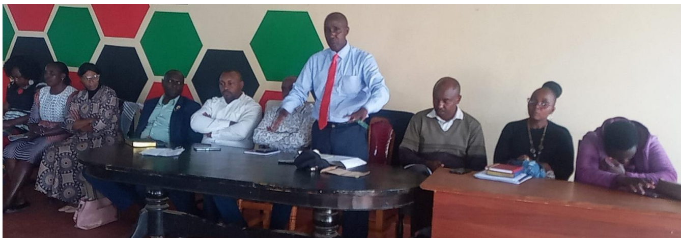
Chairman addressing people at NGCDF hall