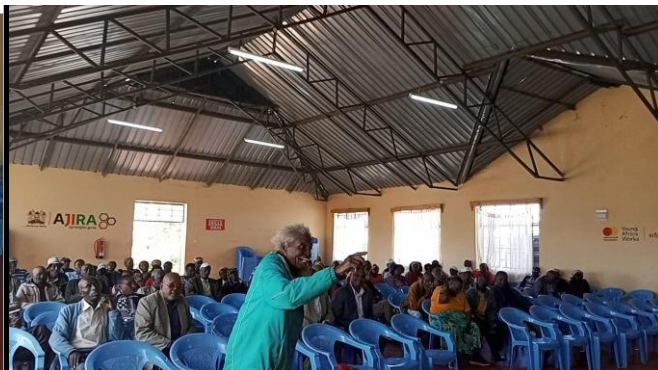
members of public participating at the ngcdf office hall