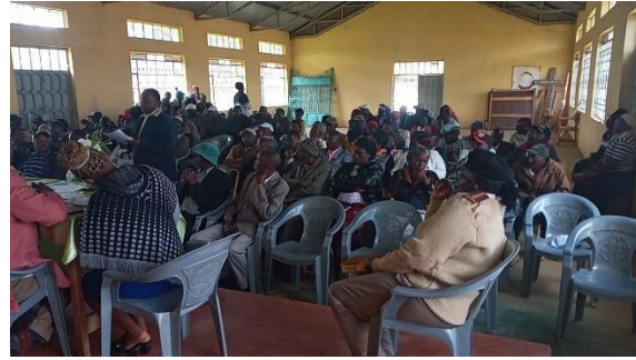
leader giving proposals to the panel at shamata catholic hall