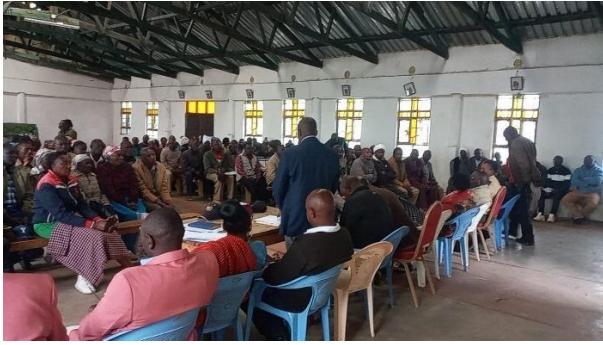
Chairman addressing members of the public at mastooo catholic church