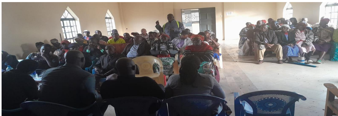
PUBLIC PARTICIPATION AT SUBEGO