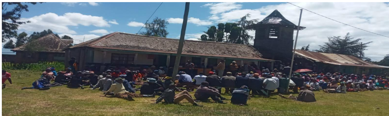
member of public presenting their project at kihara chiefs office