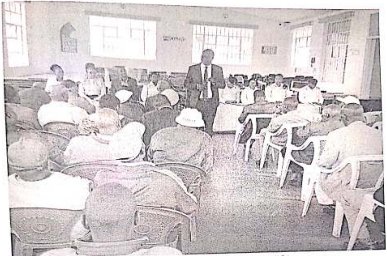
MWEIGA WARD PUBLIC PARTICIPATION AT NGCDF HALL AT MWEIGA