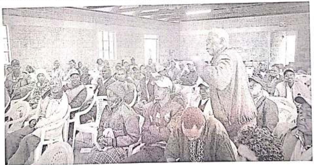
AT CHARITY PCEA CHURCH HALL FOR ENDARASHA LOCATION PUBLIC PARTICIPATIONS