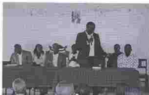
BARINGO EAST WARD ASSEMBLY