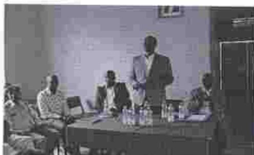
SARAGWY WARD DISCUSSION