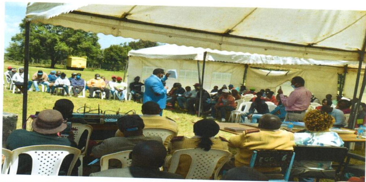
The Member of Parliament addressing the public at Limuru Mission Primary School. 1