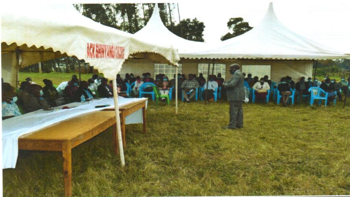
The ACC Tigoni addressing the stakeholders at St Paul's Primary School.