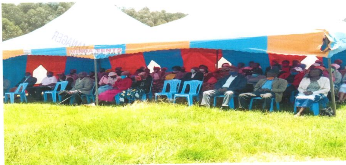
Githunguchu Primary school Grounds.

FUND ACCOUNT MANAGER NG - CDF LIMURU CONSTITUENCY