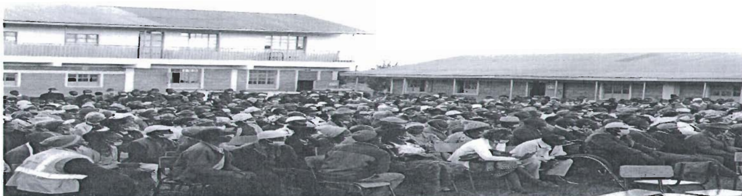
ABOVE PHOTO: Ongoing public participation at Kwaregi Primary