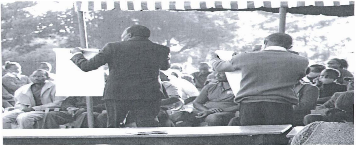
above Photo: Ongoing address at King'atua Primary