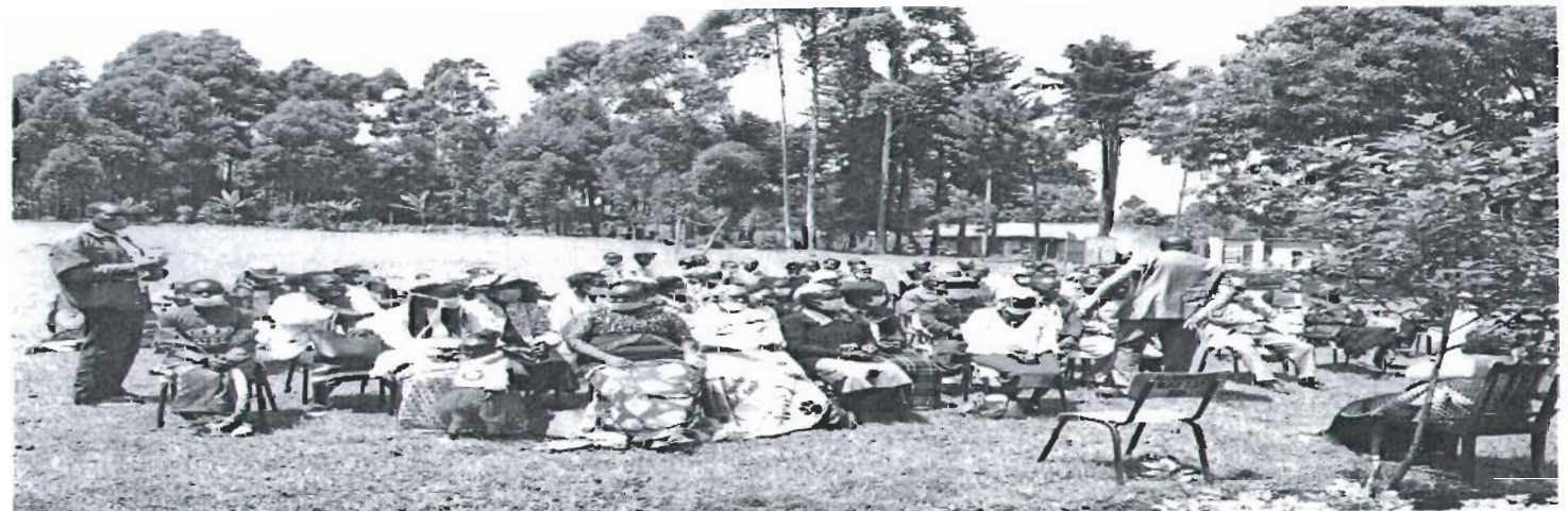
ABOVE PHOTO: Ongoing participation at Kambaa Primary

The attendance of the parents was about 85% all the parents applauded