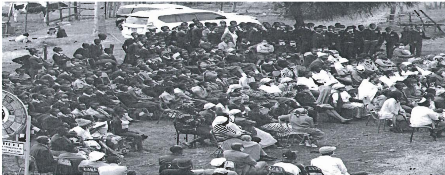
ABOVE PHOTO: Ongoing participation at Gakenge Primary