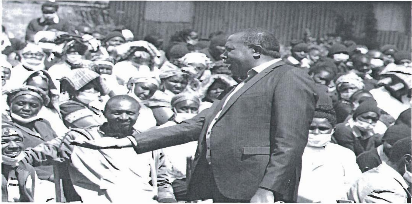
ABOVE PHOTO: Ongoing public address at Kamahindu Secondary