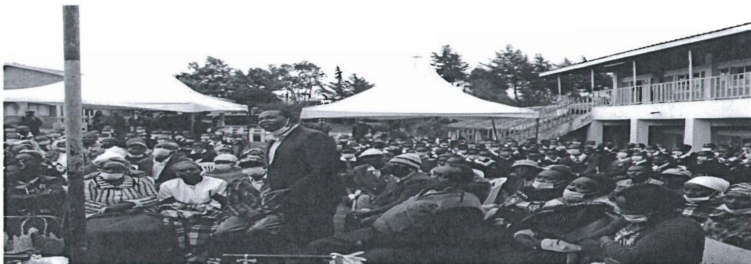
ABOVE PHOTO: Ongoing Participation at Munyaka Primary

The attendance of the parents was about 89% all the parents applauded.