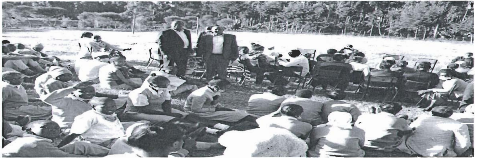
Above Photo: Public Participation at Magina Secondary