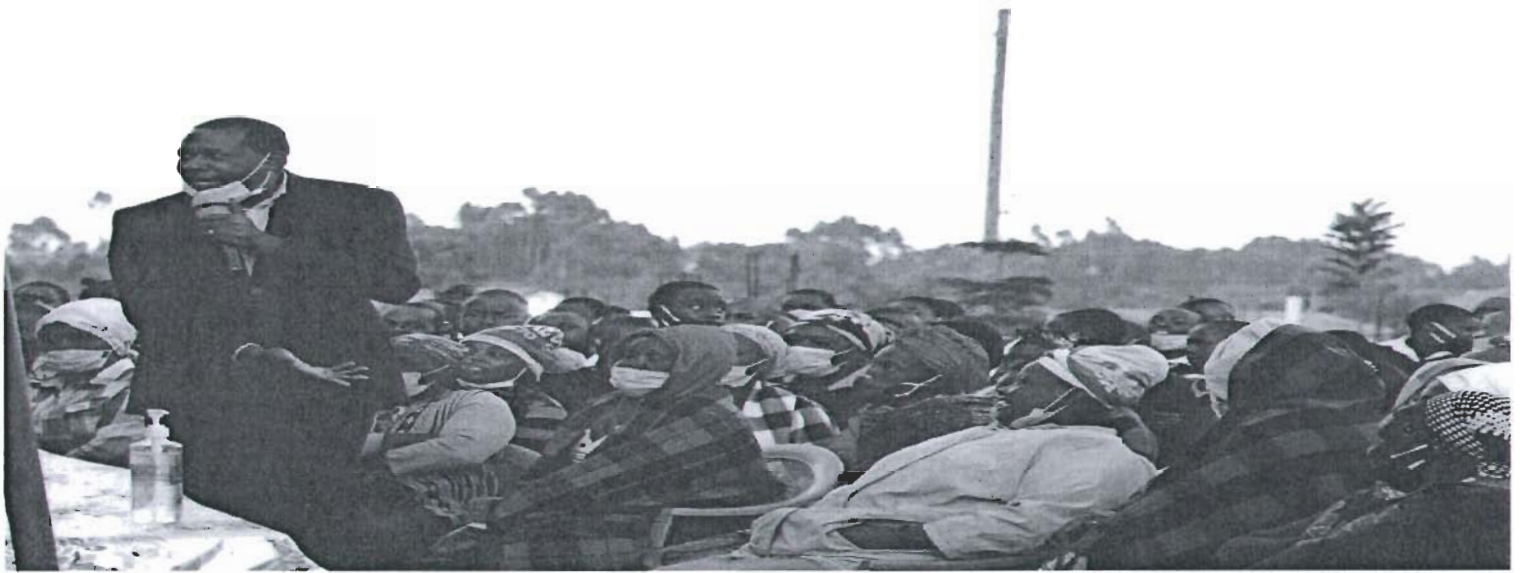
Above Photo: Public participation at Gathima Primary