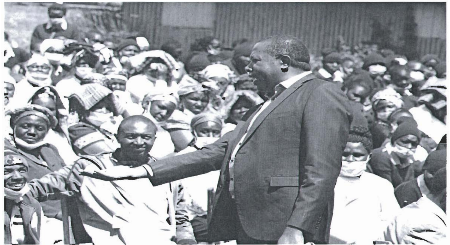
Above Photos: Ongoing public participation at UTUGI Secondary