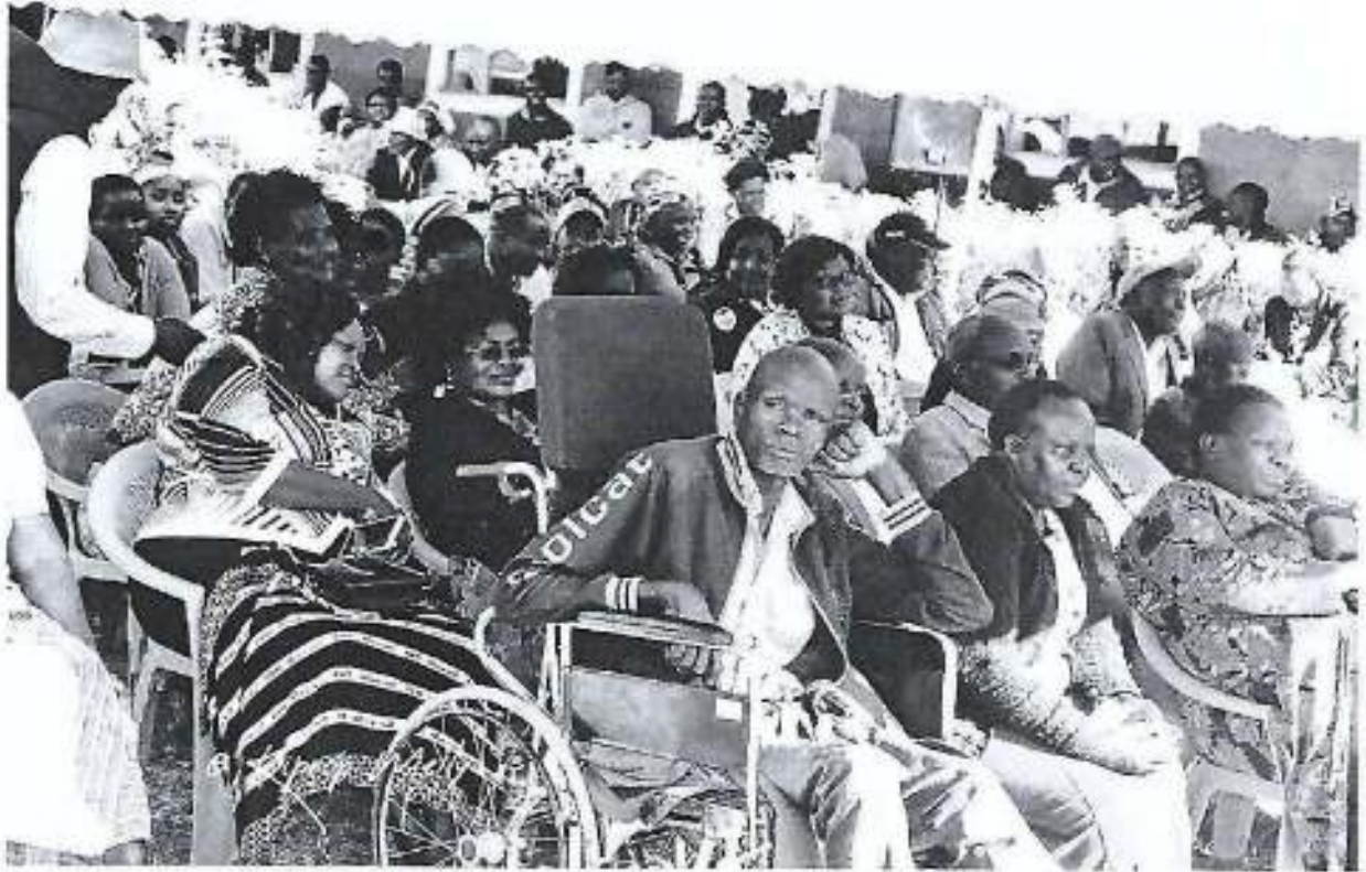
Public participation Tapsagoi ward held at St. Paul Kenduiywo primary school