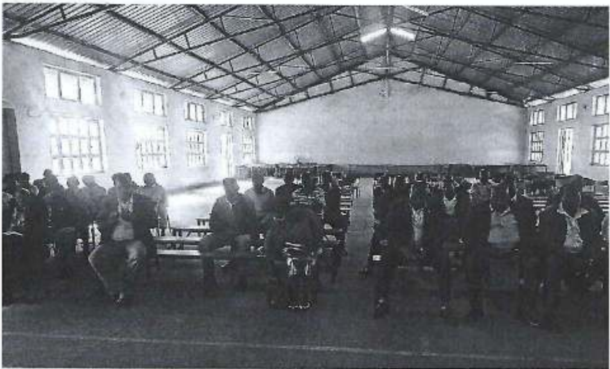
Participants at Kiplombe ward at Kapkeben Secondary school