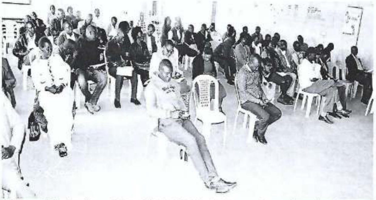
Public participation Ngenyilel ward held at St. Mary's Osorongai secondary school