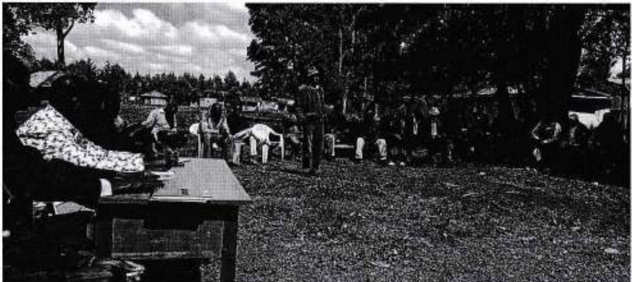
Public participation at Lelmokwo/Ngechek Ward