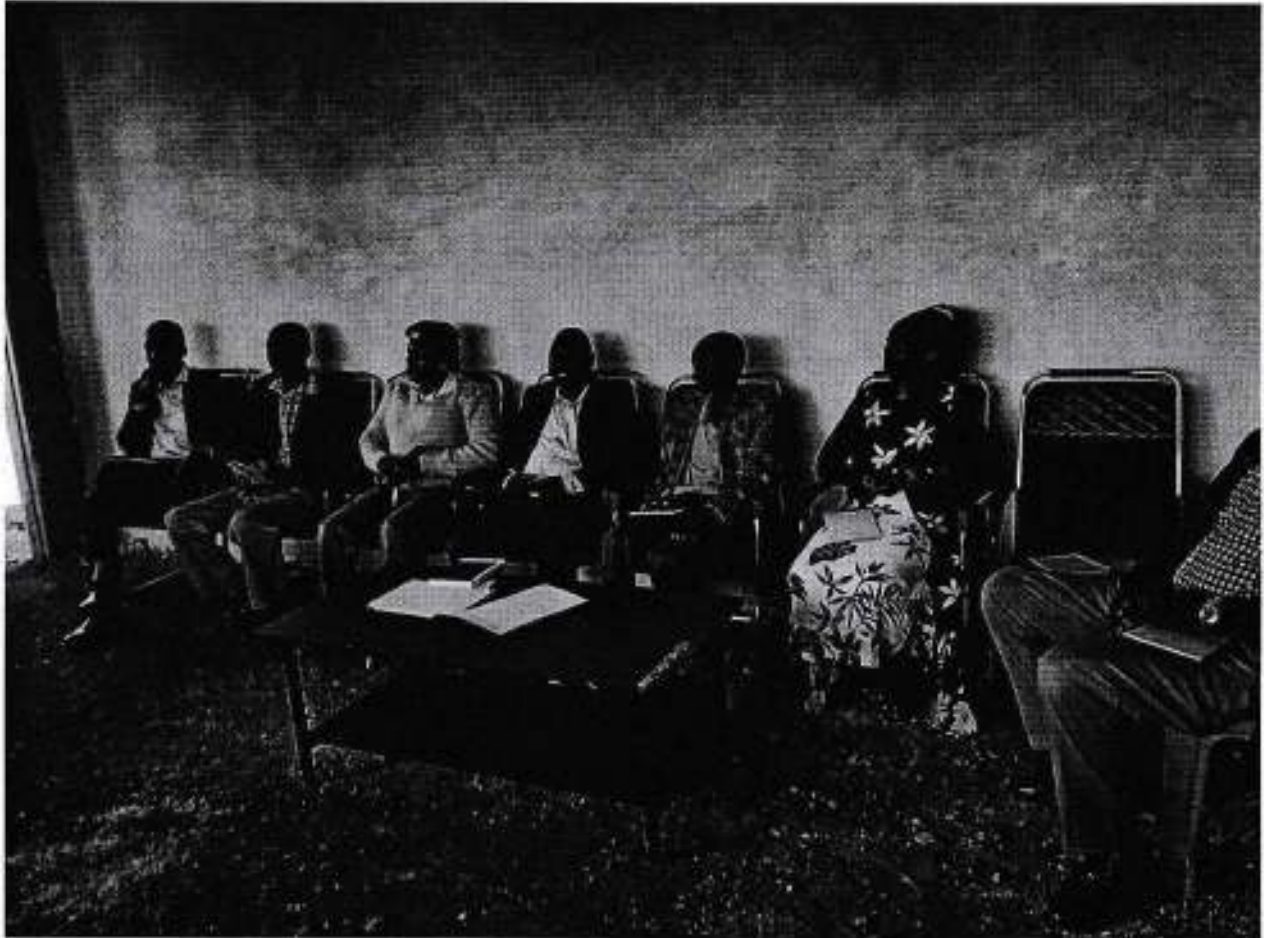
Public participation at Chemundu/Kapngetuny Ward