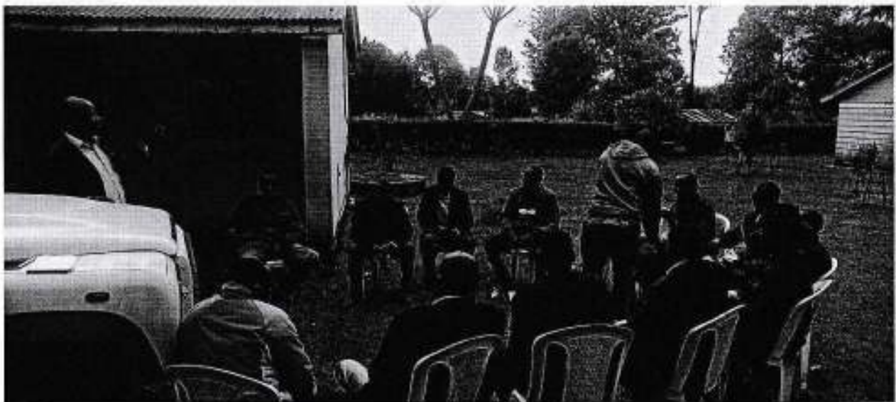
Public participation at Kosirai Ward