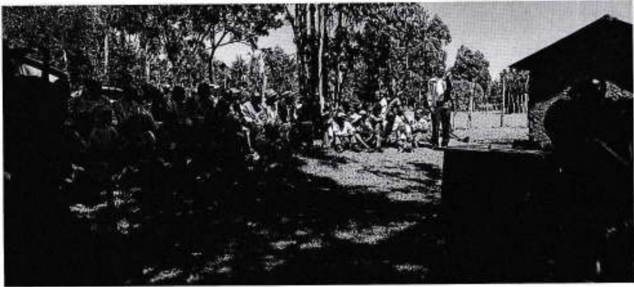
Public participation at Kiptuiya ward