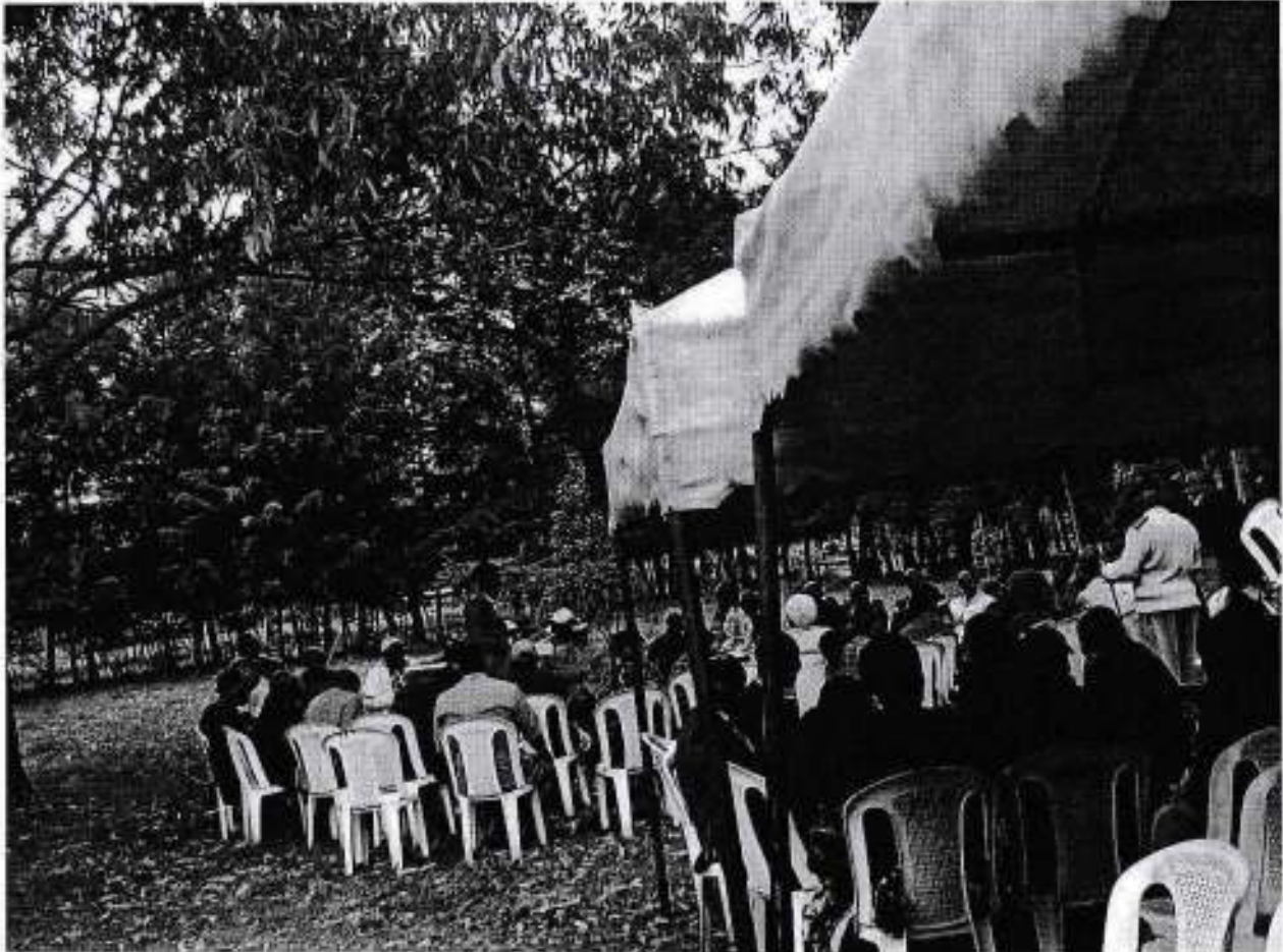
Public participation at Kaptel/Kamoiyo Ward