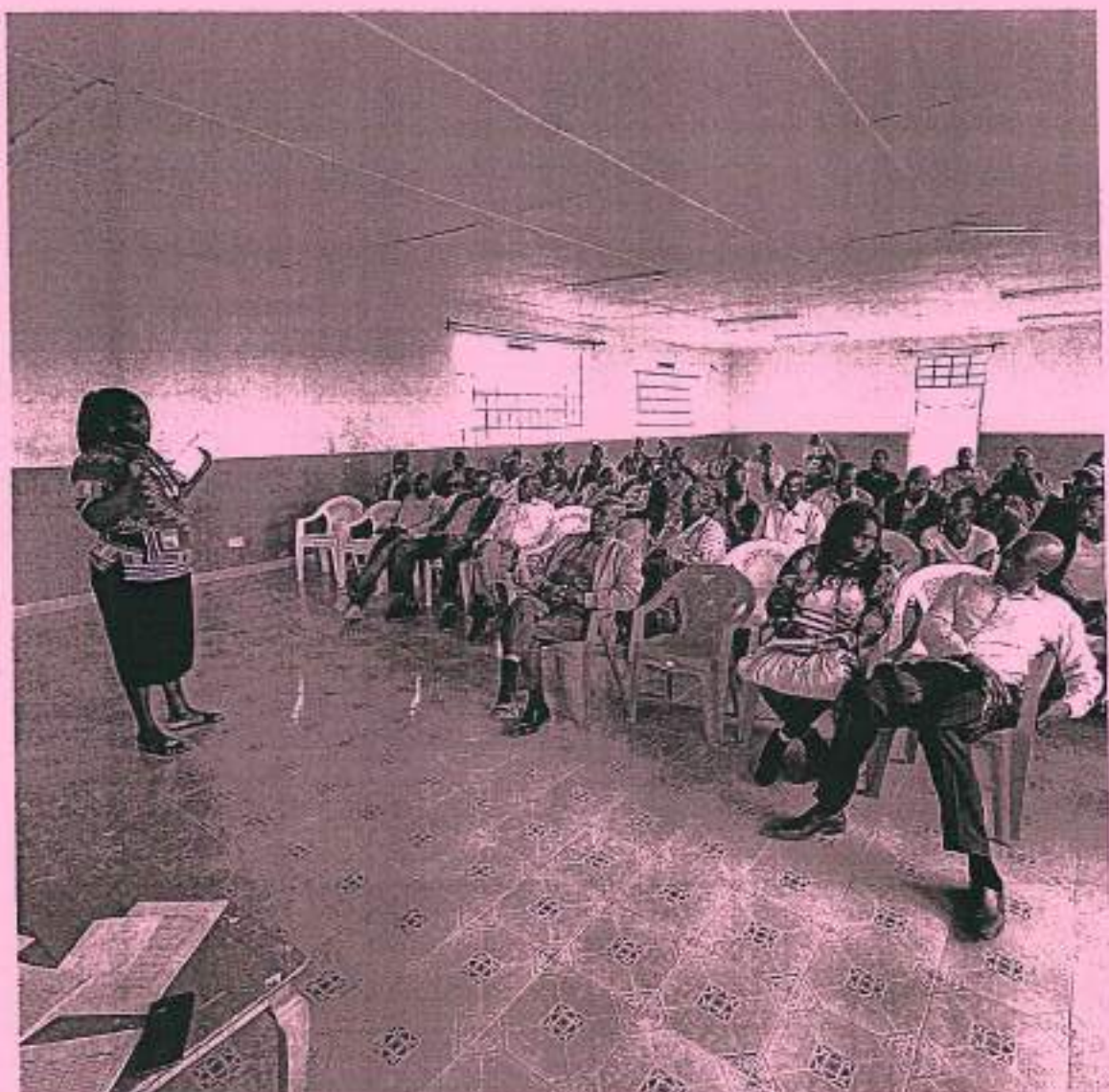
PIC 7: PUBLIC FORUM IN KAMPI YA MOTO IEBC HALL – VISOI WARD