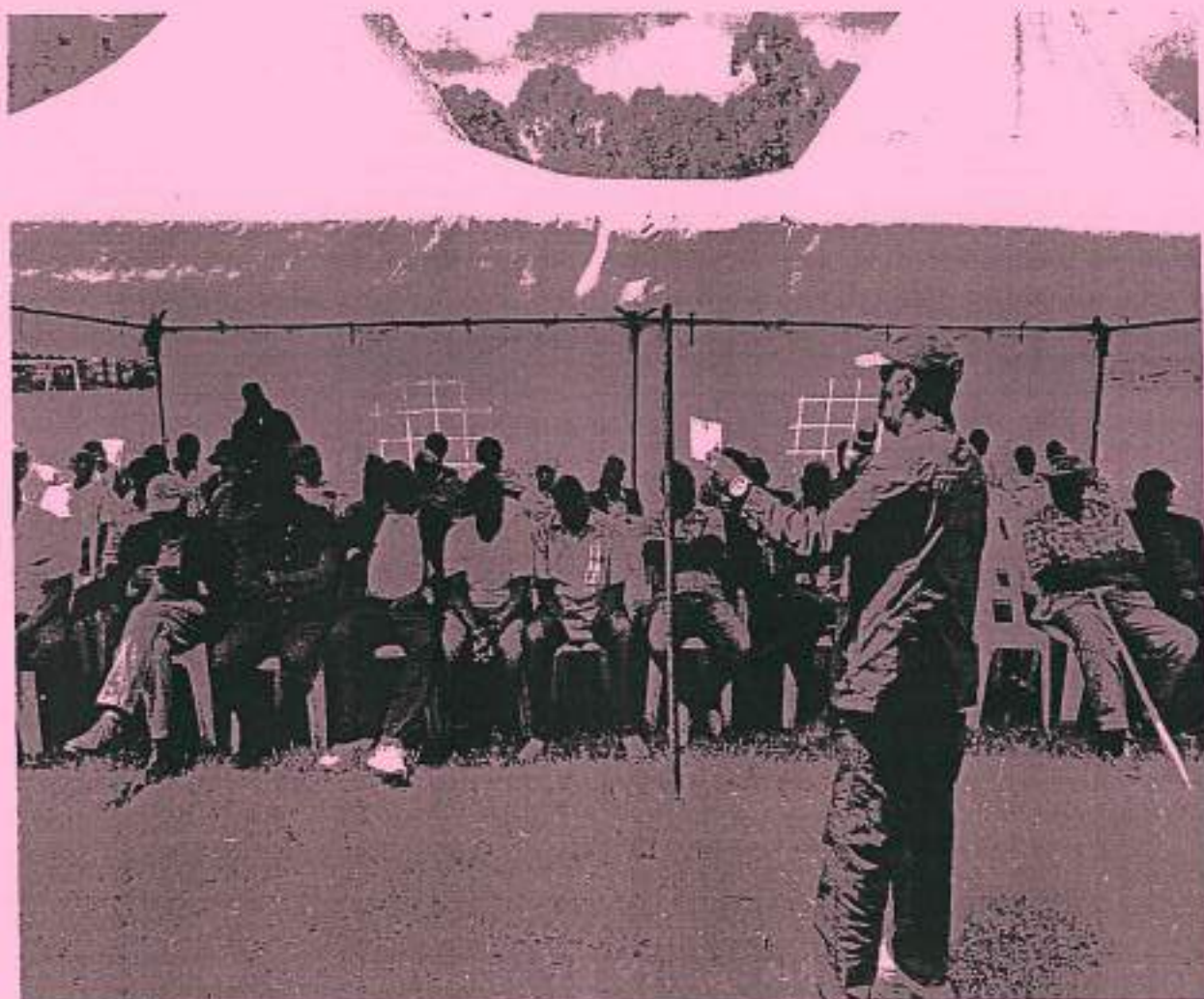
PIC 1: PUBLIC FORUM IN MERCY NJERI PRIMARY – MENENGAI WEST WARD

RONGAI NG- CDF 18 FEB 2015 P. O. Box 12848, NAKURU Tel: 0791 490 923