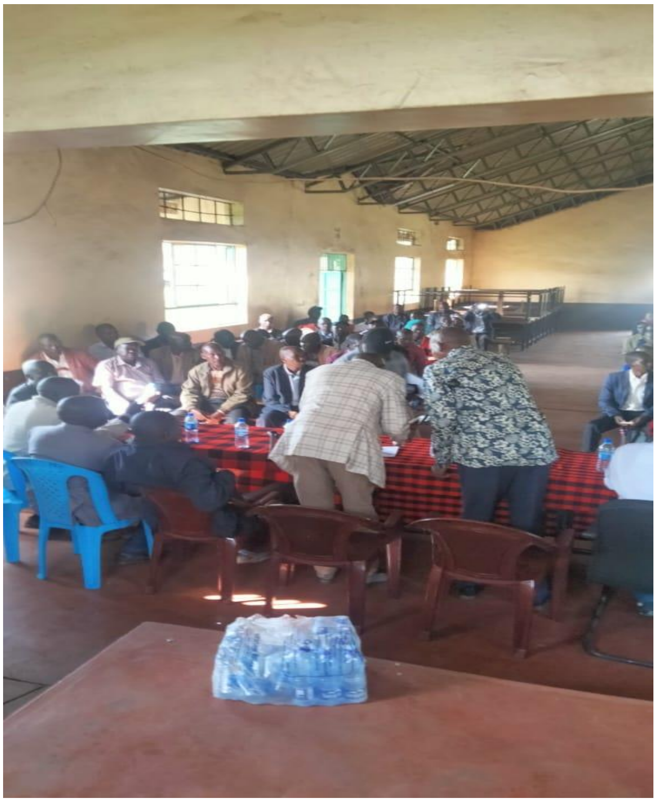
Naikarra ward residents during open forum public participation meeting held at Olderkesi secondary school on 28th Dec 2022.