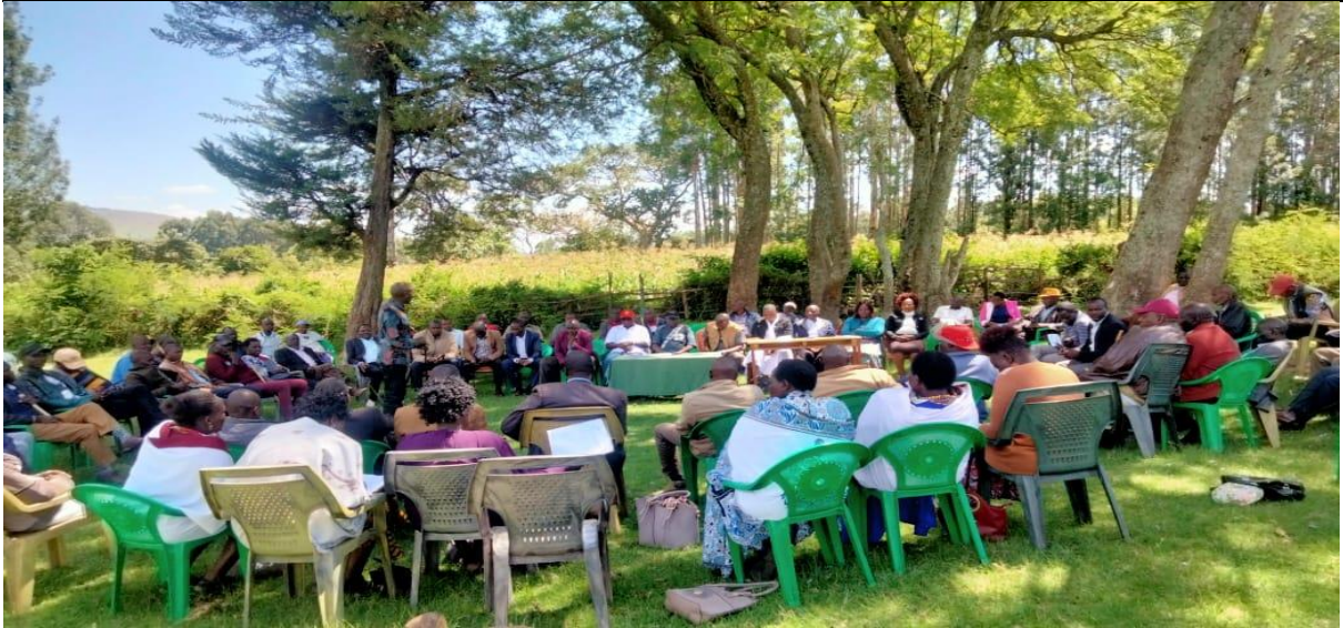
Siana Ward Residents during open forum public participation meeting held at Sekenani Primary School on 23rd Dec 2022.