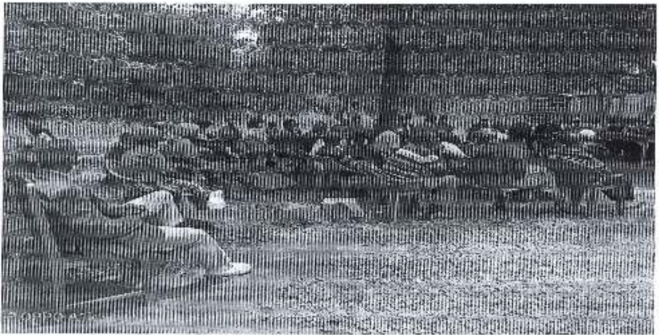
Bunyala East Ward