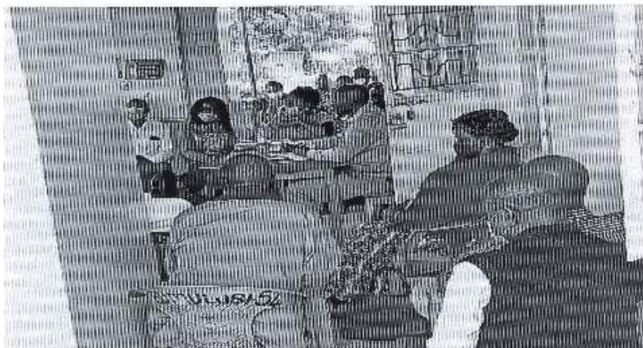
Bunyala Central Ward