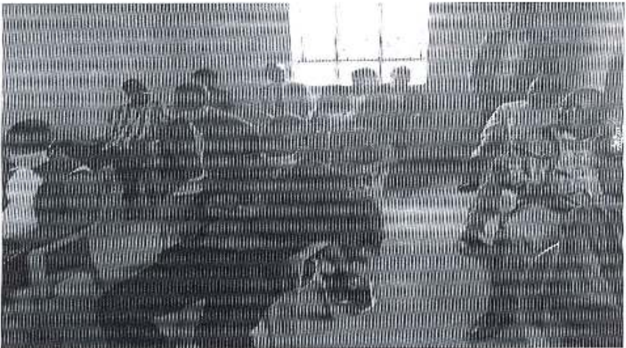
Bunyala West Ward