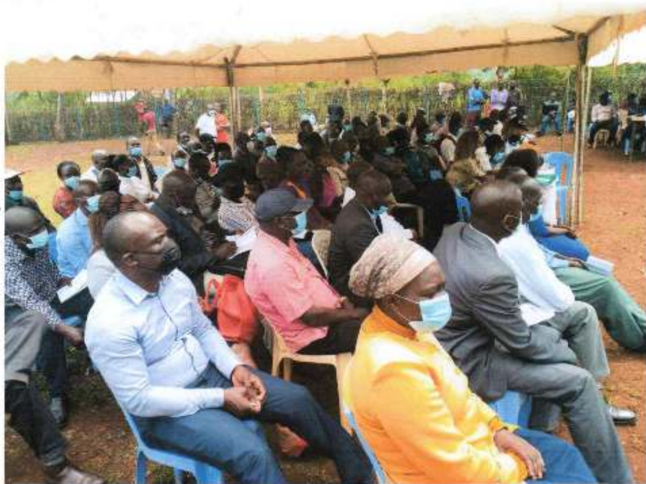
Figure 1: Members during the Public Participation.