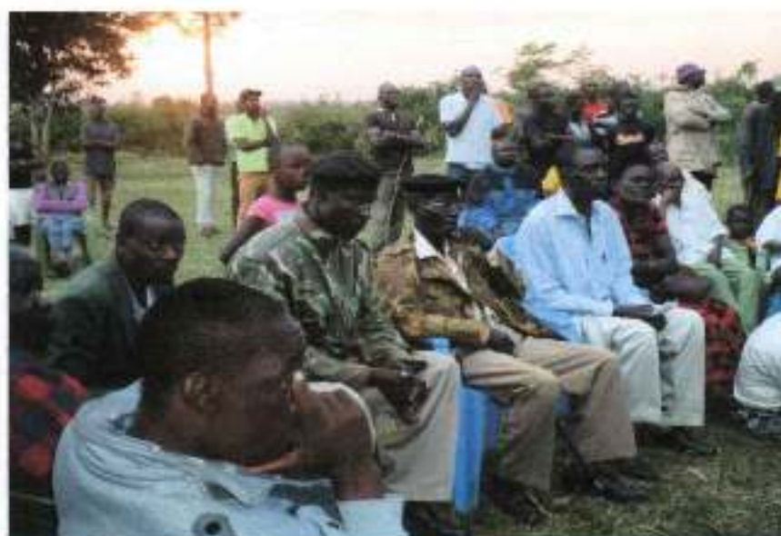
Figure 2: Members during the meeting.