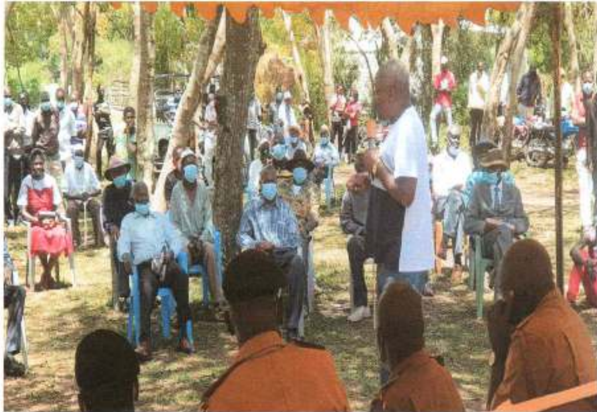
Figure 1: The Member of Parliament addressing the members.