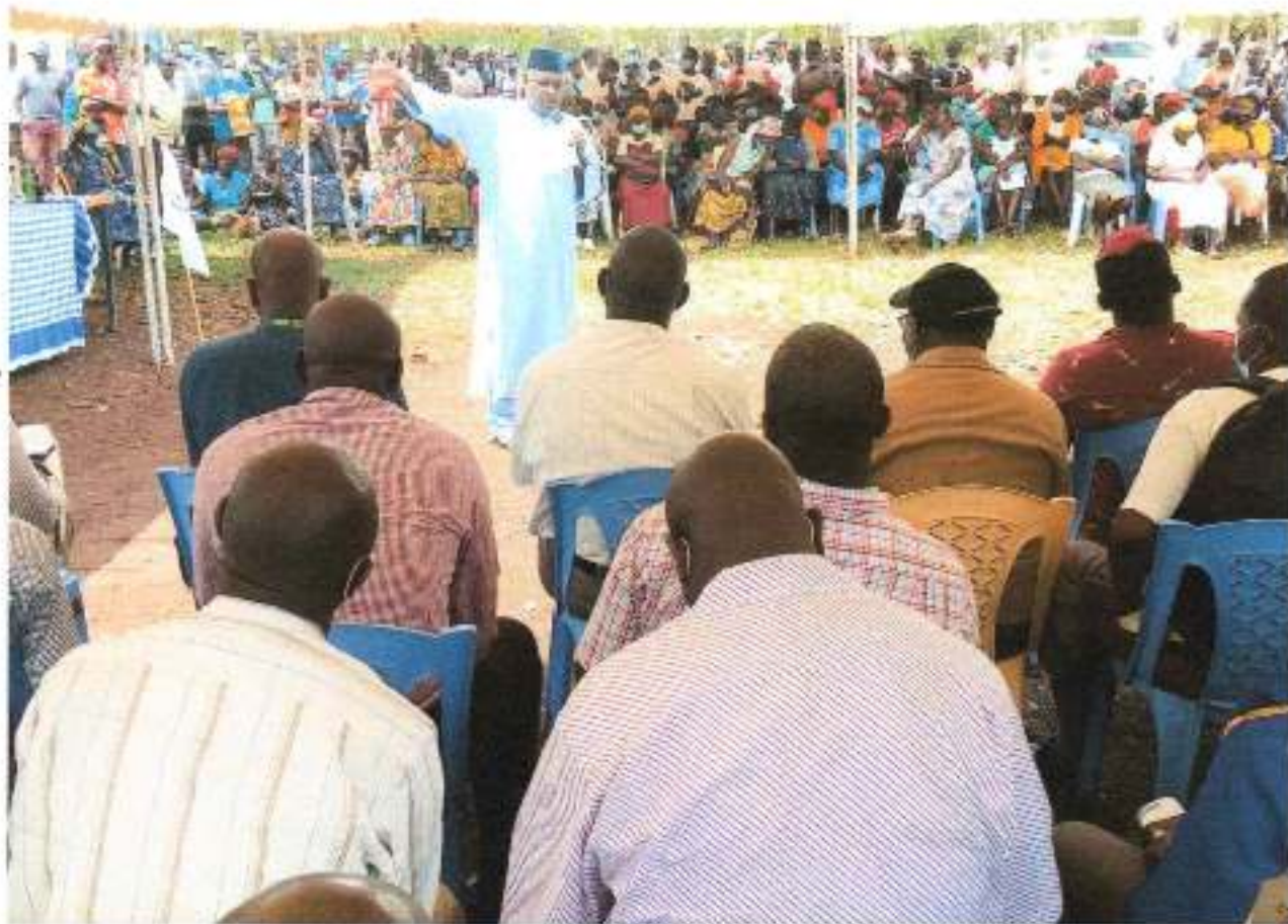
Figure 1: The Area Member of Parliament addressing the Public.