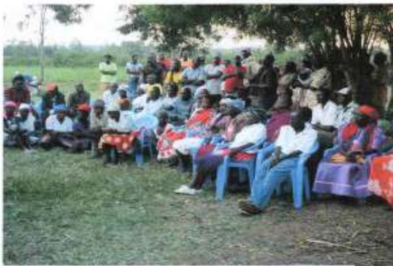
Figure 3: Members of the Public during the meeting.