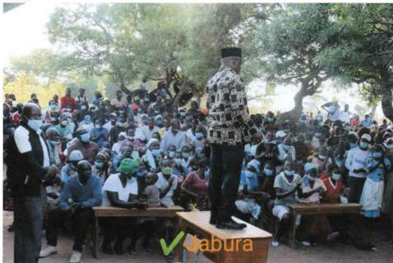
Figure 1: The Member of Parliament addressing the Public.