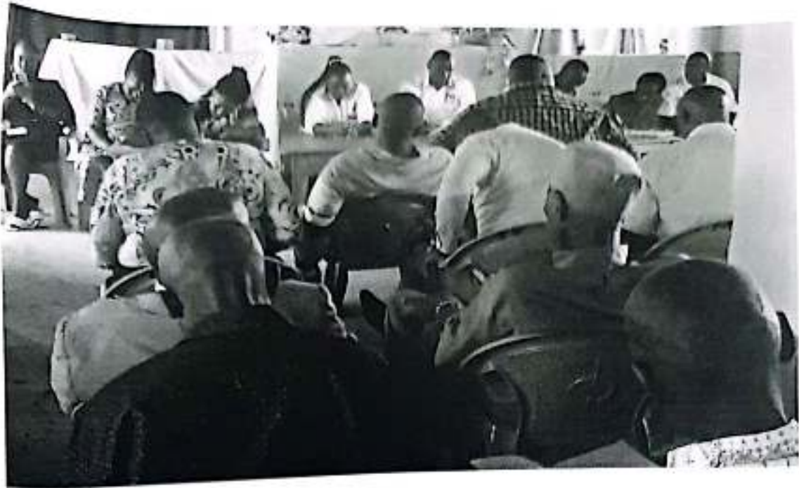
KAKRAO WARD Public Participation Meeting.