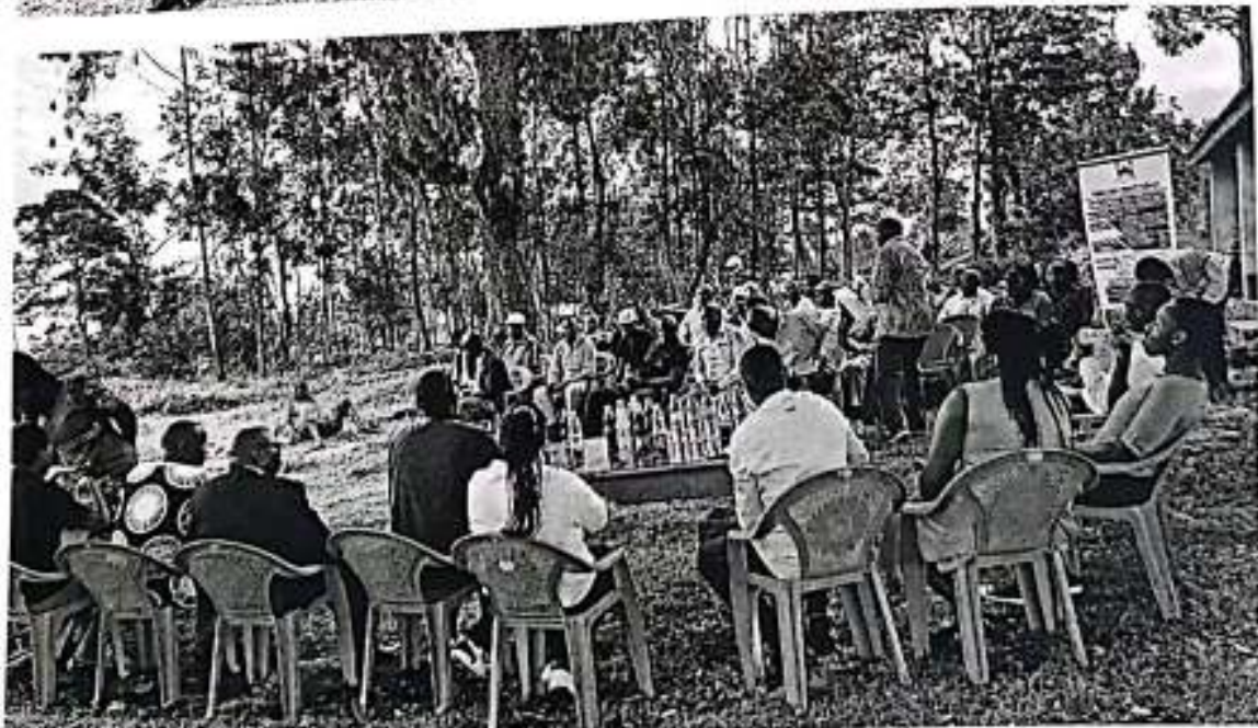
GOD JOPE WARD Public Participation meeting January 2023