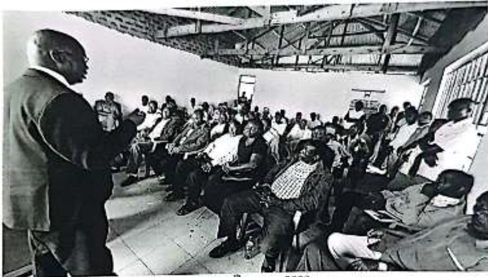
DCC Gracing the occasion at KWA Ward on 10 th January 2023.