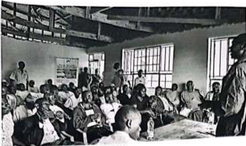
KWA Ward Public Participation meeting.