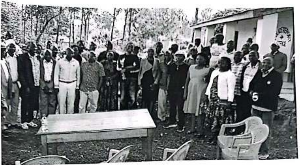
God Jope Ward Public Participation.