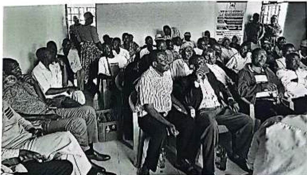
Participant of KWA Ward listening to FAM Talk.