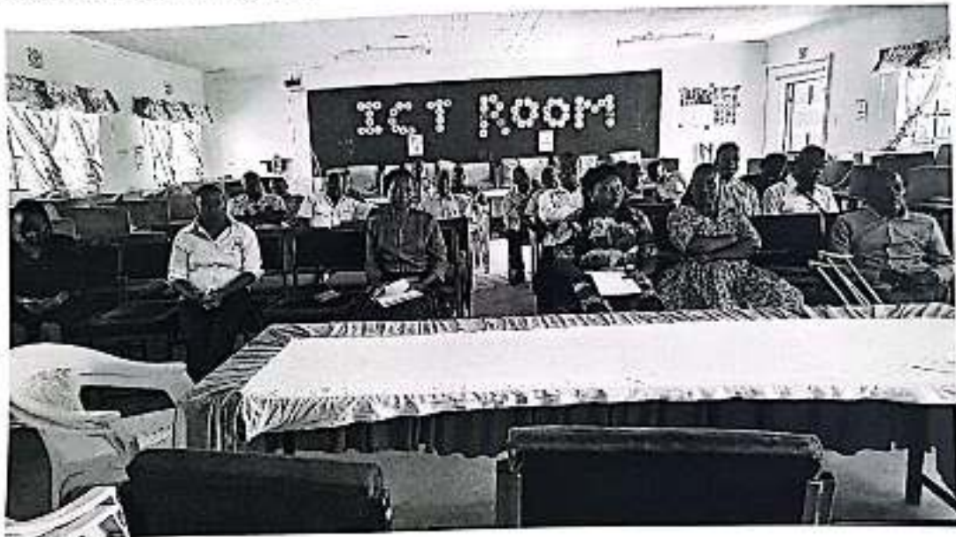
Central Ward Public Participation meeting.