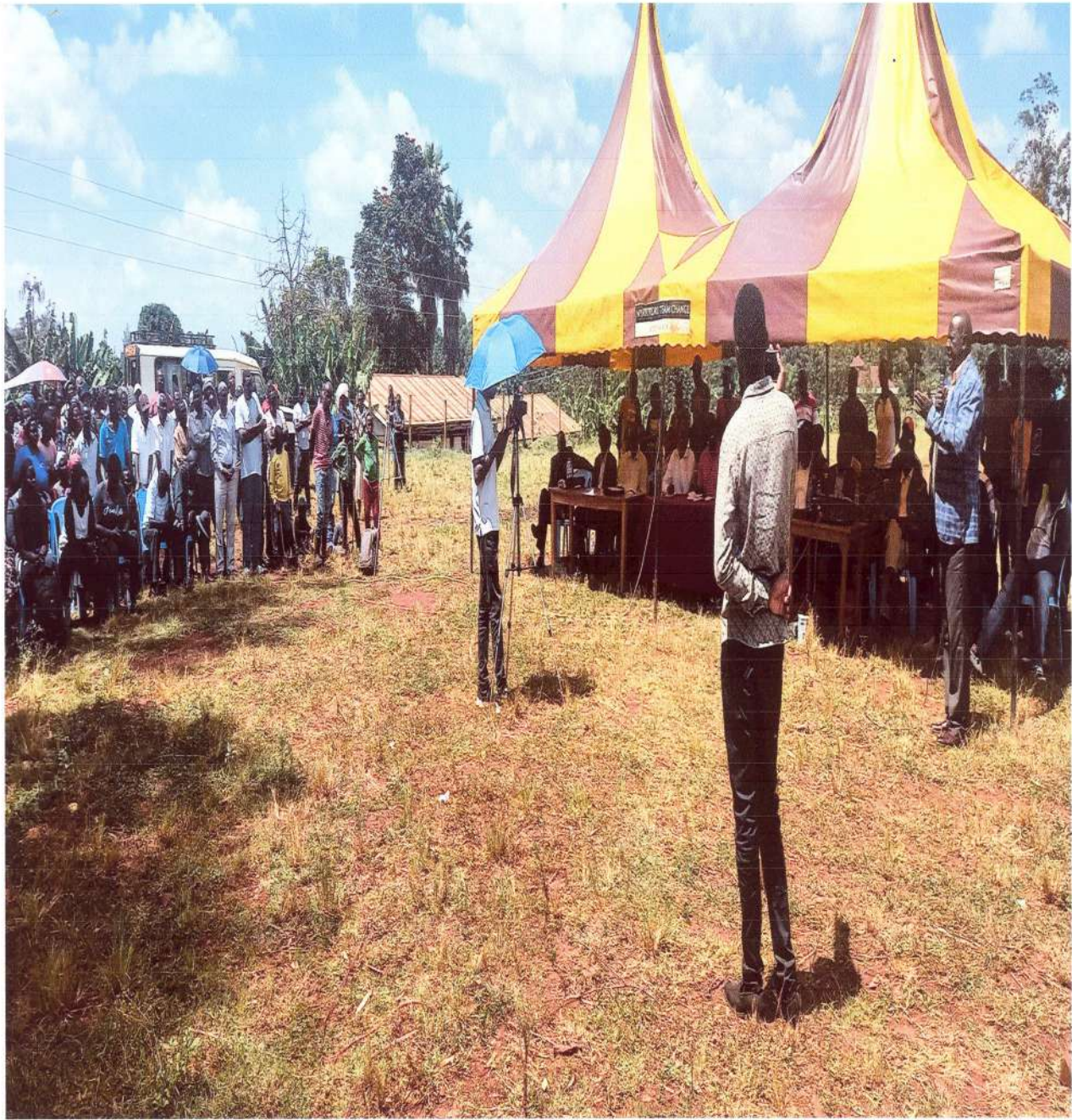
KITUTU CENTRAL WARD.