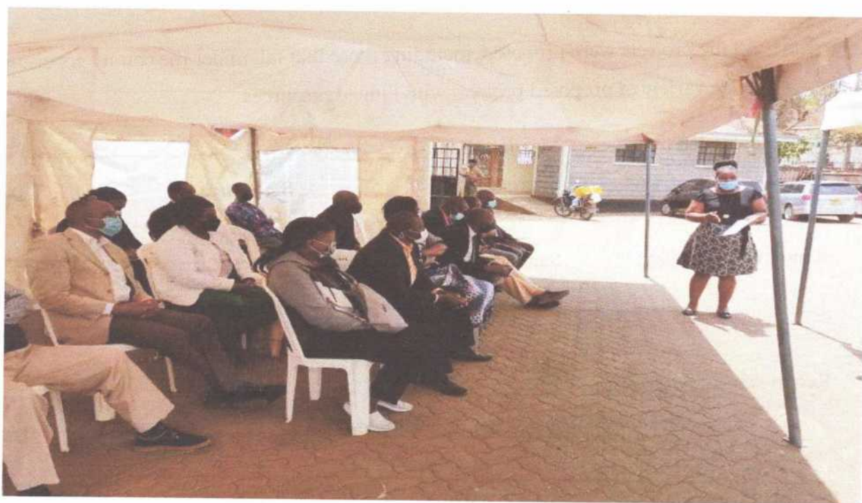
Address by a participant- Day 2