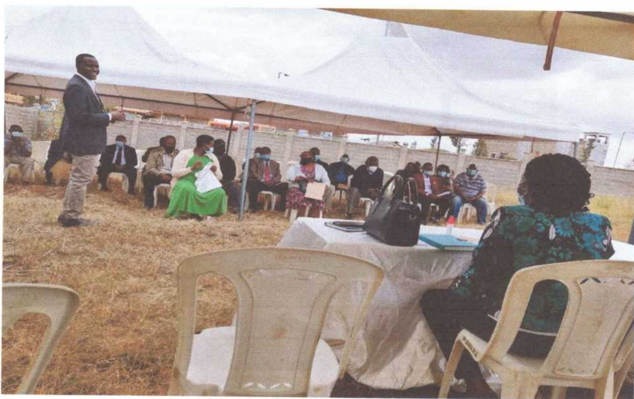
Address by NG-CDFC Chairperson- Day 1

[Three handwritten signatures in blue ink]