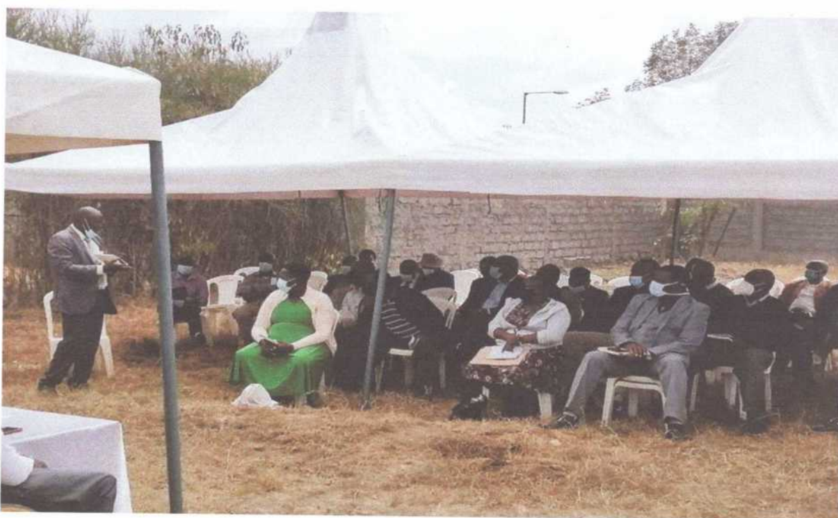
Address by a participant- Day 1