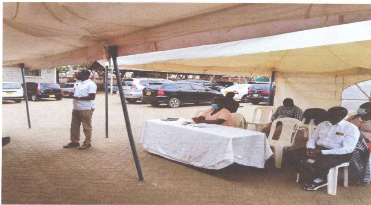
Address by the NG-CDFC Chairperson- Day 2