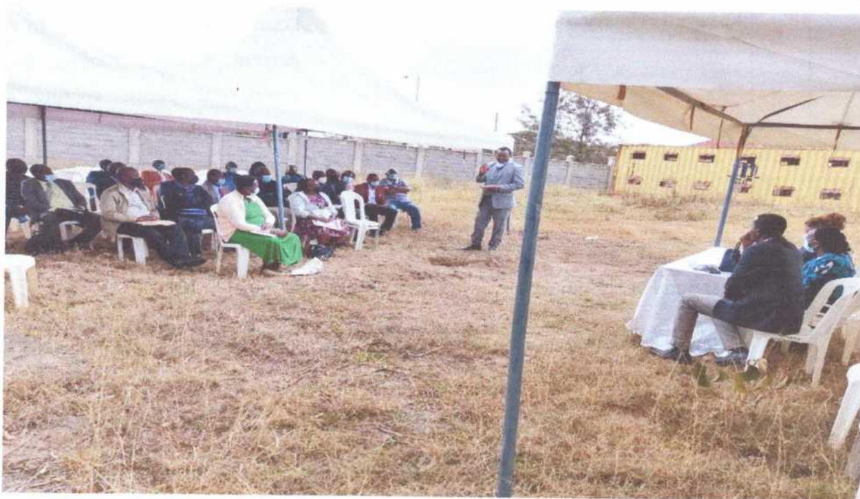
Address by a participant- Day 1