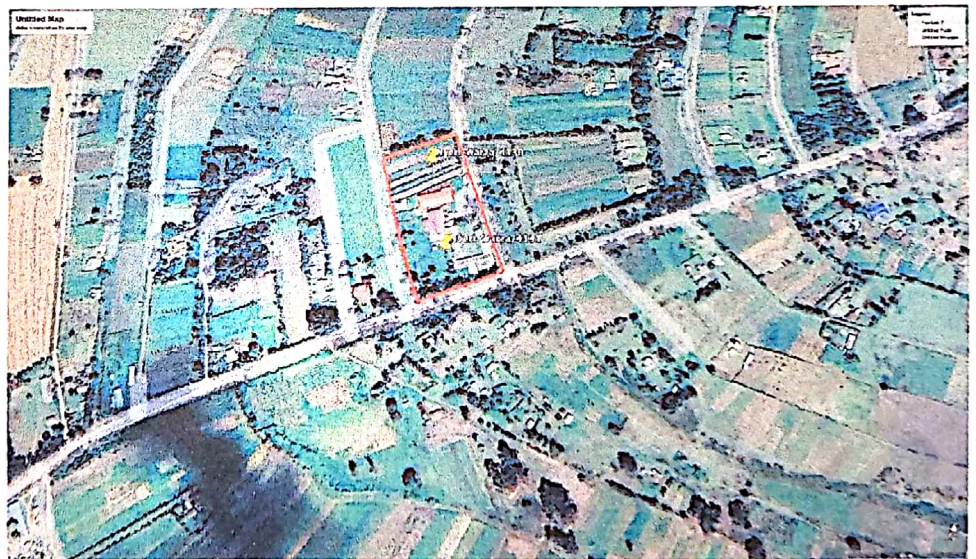
A google excerpt of the subject property. Co-ordinates: 0°14'59.27"S, 37°5'51.23"E