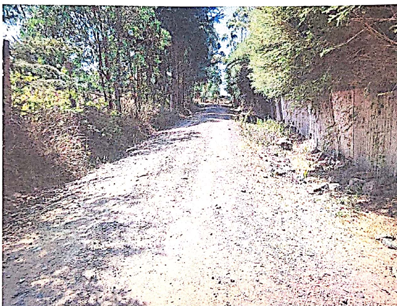
Access to the property