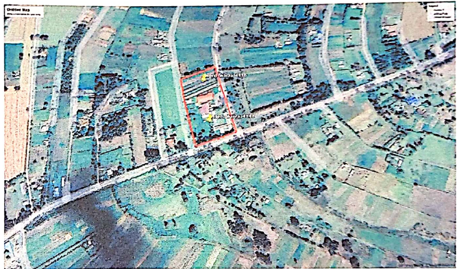
A google excerpt of the subject property. Co-ordinates: 0°14'59.27"S, 37°5'51.23"E