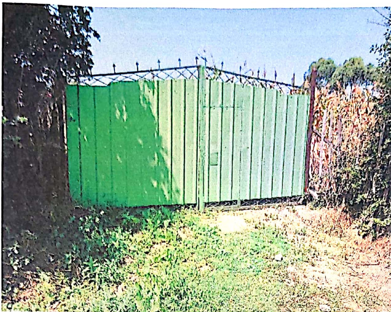
Entrance to the property