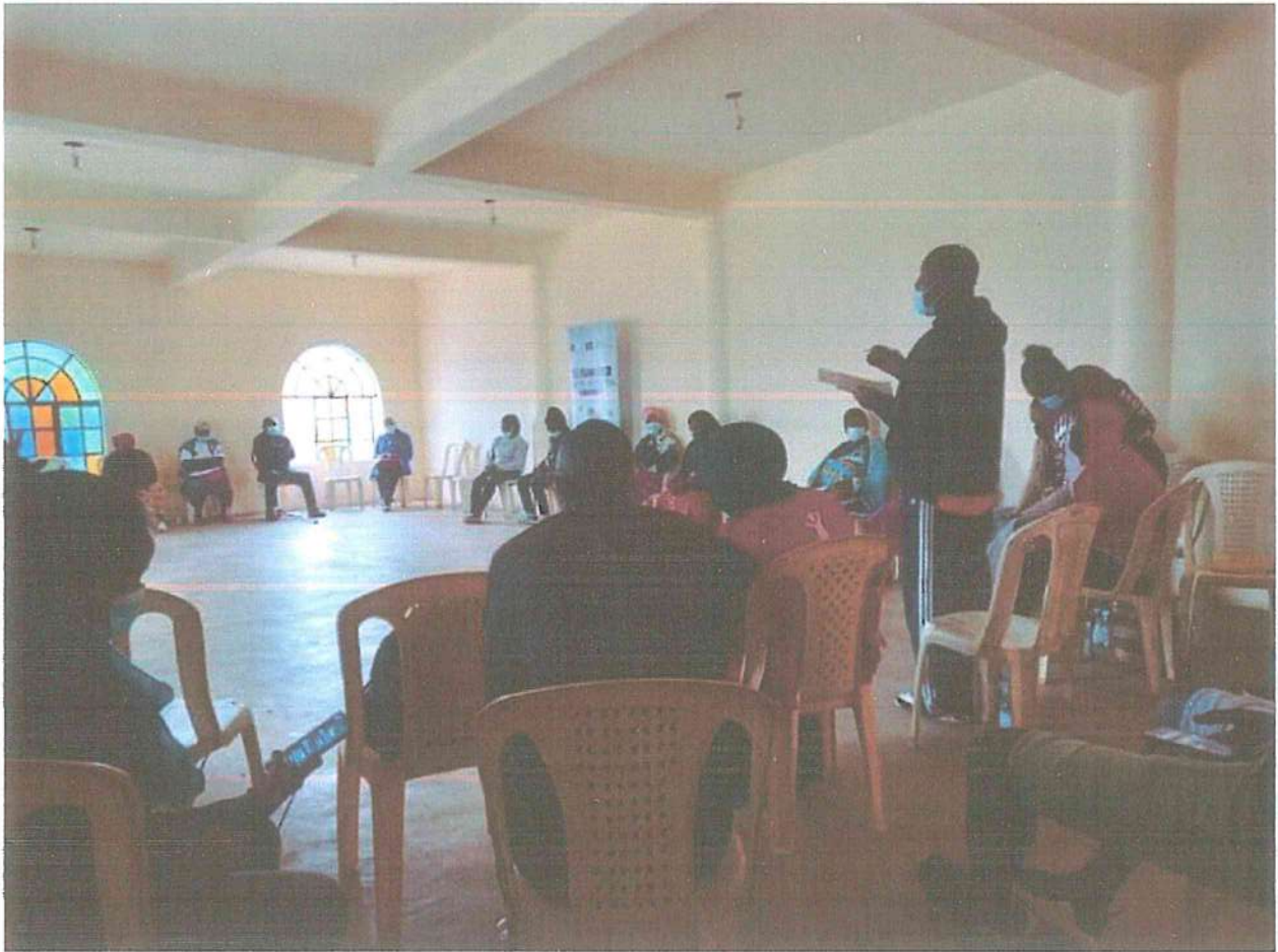
Highrise ward public participation forum held at Canaan Hall.