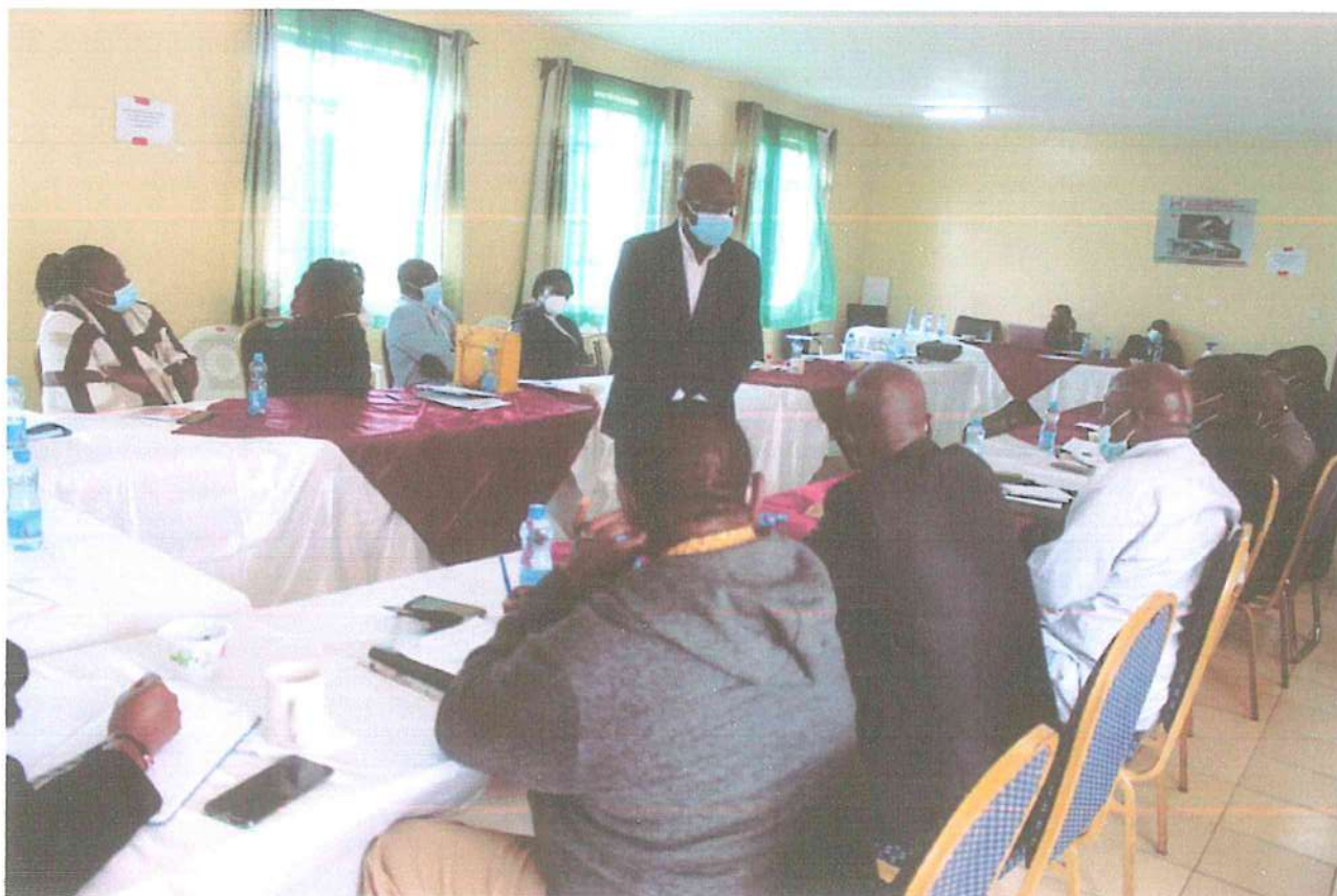
Education stakeholders' consultative meeting