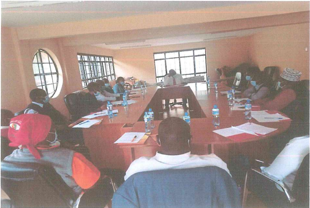
Security stakeholders consultative meeting.

The exercise was carried out on the 8 th July 2021 and 12 th July 2021 under two sectors that is the Security and Education stakeholders. The security sector was held at the Langata DCC's boardroom, while the Education sector meeting was held at the Langata NG-CDF Boardroom.