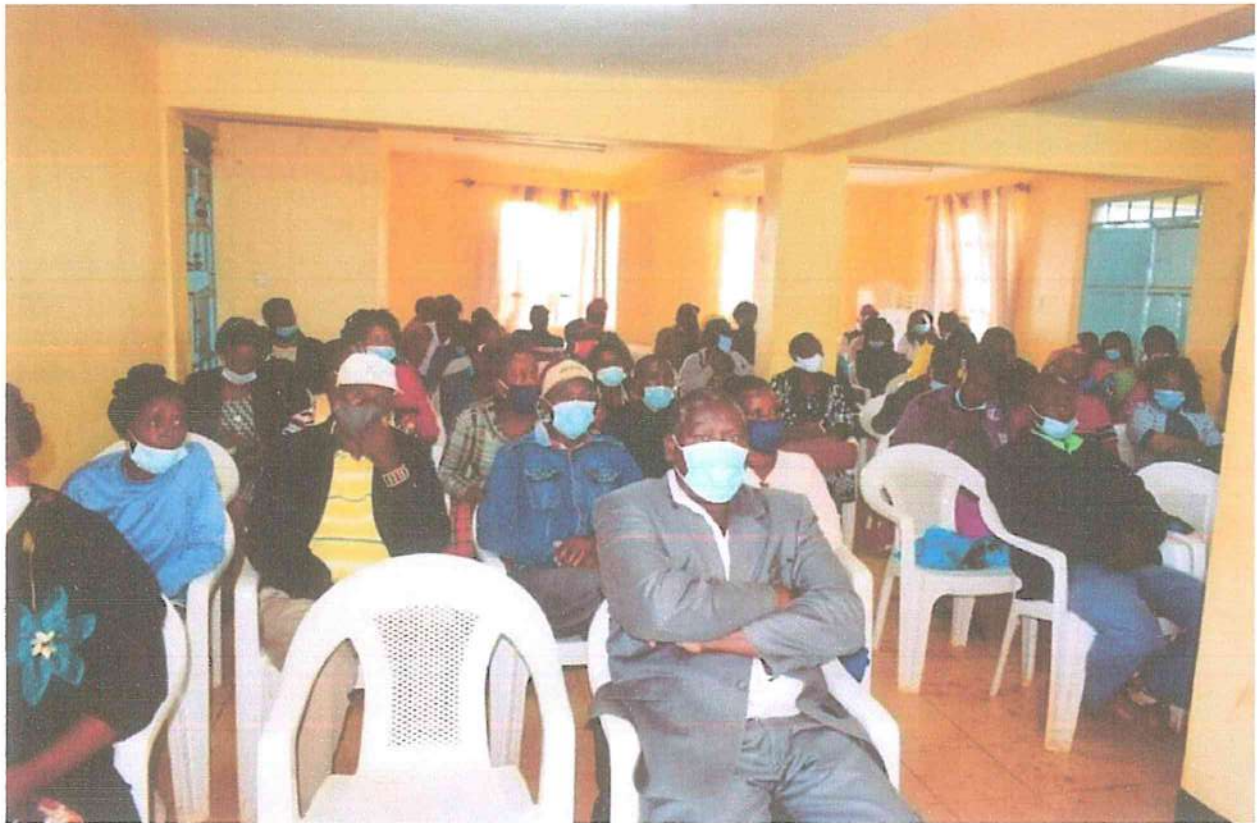
Nairobi West Ward public participation held at Madaraka Primary School multi-purpose hall