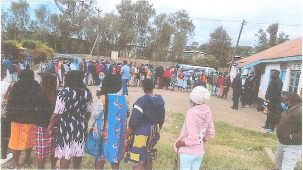
Public participation meeting in Mugumoini ward