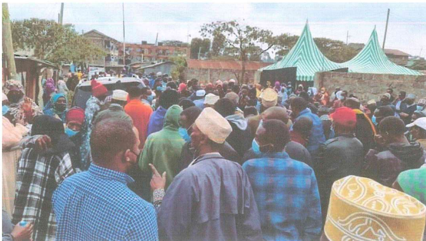
South C Ward public participation held at the 5-Star ground