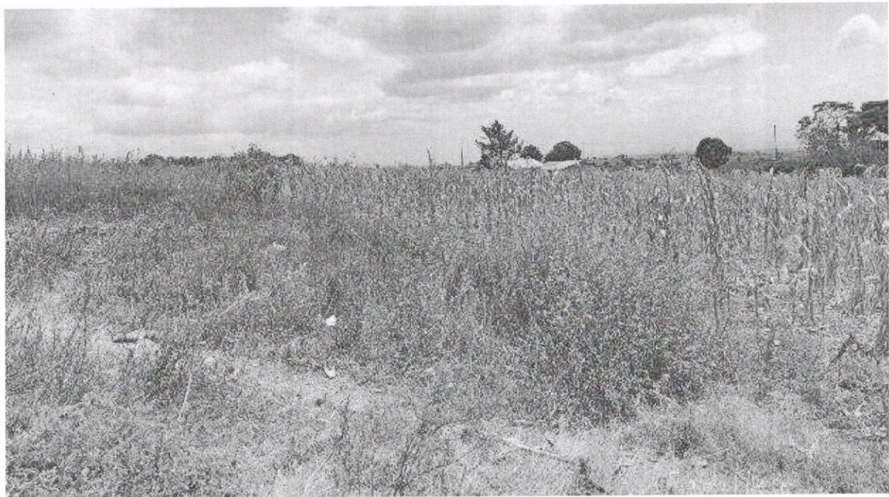
Views of the property