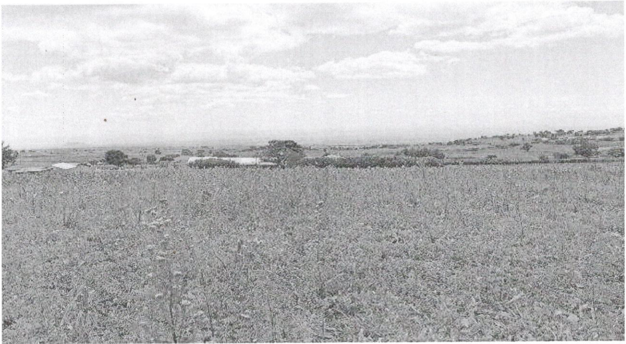
Views of the parcel